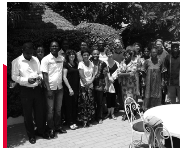
The Board and the team of the International Alliance of independent publishers

We are thus very much looking forward to meeting you in Cape Town – 62 publishers will be making the journey to meet you there!